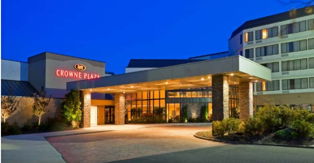
CROWNE PLAZA 690 Route 46 East Fairfield, NJ 07004

Experience new feature presentations, training, workshops, and round table discussions that are built to facilitate your success.